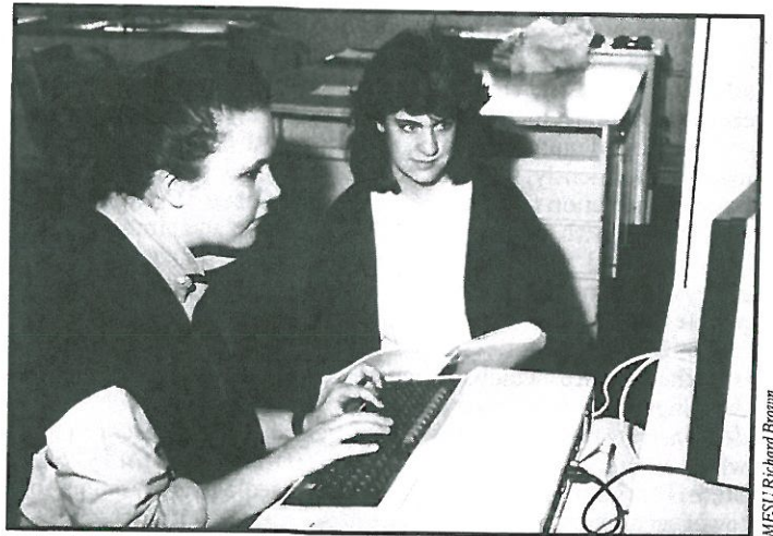
"Hands on" ... getting started

The pack will contain teachers' notes, with a step-by-step guide to the simulation, hints on managing the project work in the classroom and detailed instructions for using the computer. An information booklet gives an up-to-date account of the prehistory